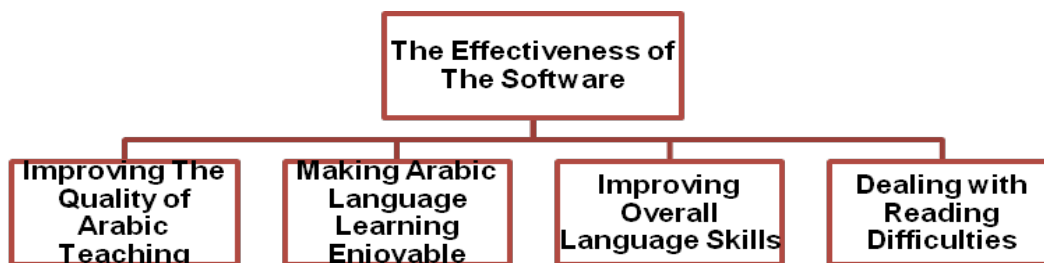
Figure 1. The effectiveness of the software

The central focus of this study was to assess the teachers' perceptions of the effectiveness of using designed software in ALTL. To answer question 1: How effective is the use of AL software in ALTL from Arabic teacher's perceptions? Four sub-themes emerged regarding the effectiveness of using the software: "Improving the quality of Arabic teaching", "making Arabic language learning more enjoyable", "improving overall language skills"; and "dealing with reading difficulties". The following section discusses the effectiveness of using the designed software from teachers' perspectives, and they are summarized in Figure 1.